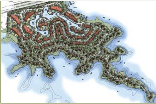
Marina Resort — Wuzuidong Property at Thousand Islands Lake, China.

together, we can bring the resources found in much larger multi-disciplinary firms while maintaining the comfortable flexibility and personal touch of a smaller office. If you need the horsepower of a large office but don't want to be treated like a number, give the Alliance a call.