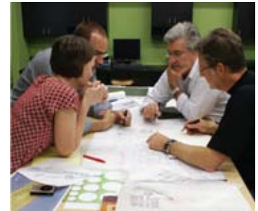
Design alliance members conducting a charrette for a high-end resort community in Southeastern Russia.