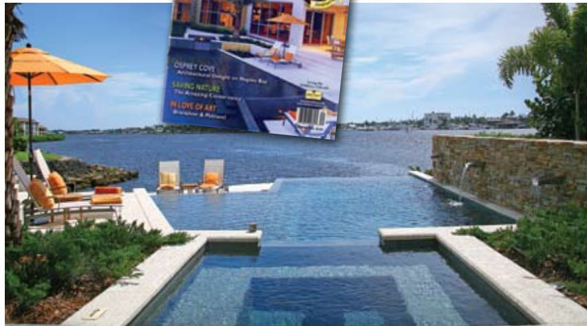
The azure blue pool blends into the deep hues of Naples Bay on this modern design.

The added publicity just reinforces what our clients have always known—a beautiful pool and outdoor living design will create excitement and conversation about the home.