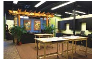
FLEX WORK AREA